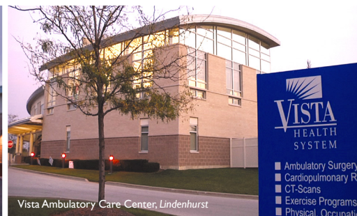
Vista Ambulatory Care Center, Lindenhurst