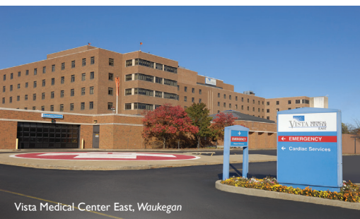
Vista Medical Center East, Waukegan