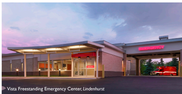
Vista Freestanding Emergency Center, Lindenhurst